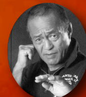
Ustad Guru Dan Inosanto